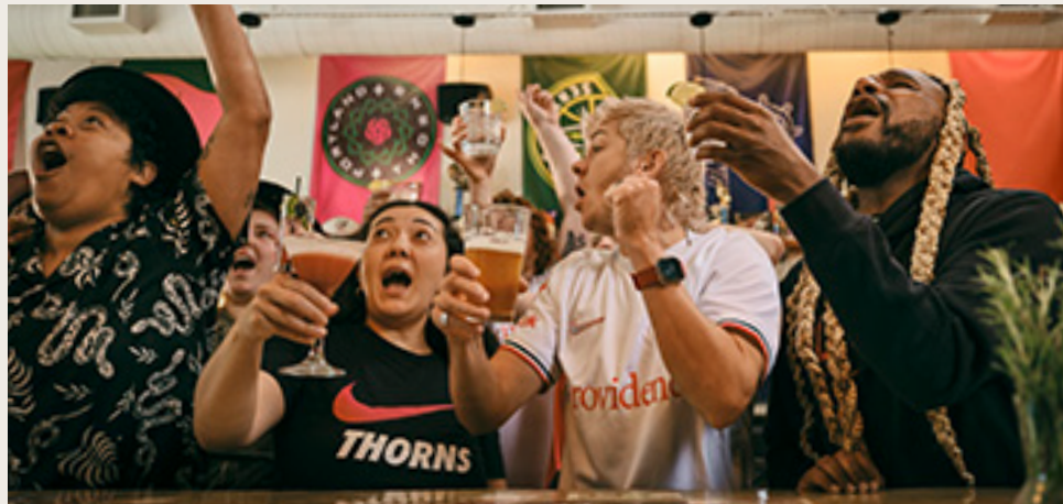
No Sales Tax on Anything!

90 mins or less to the Oregon Coast, mountains, Columbia River Gorge or wine country.