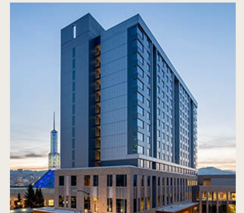
Portland Hotel Package

VIP care from our exceptional Sales & Services teams.