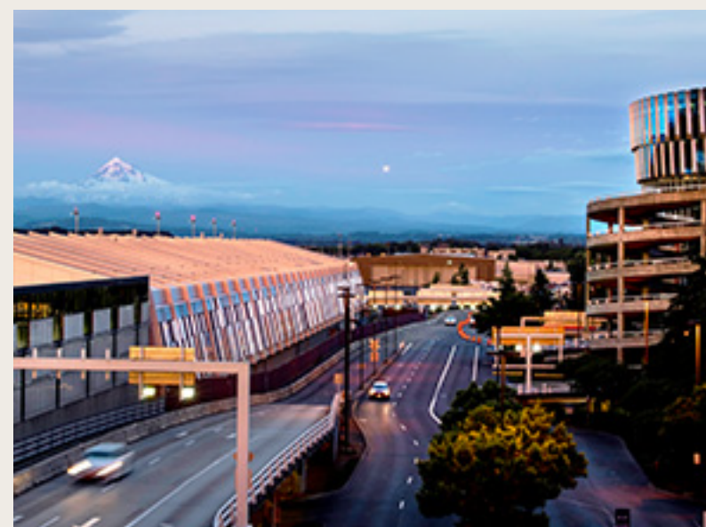
Portland International Airport (PDX)