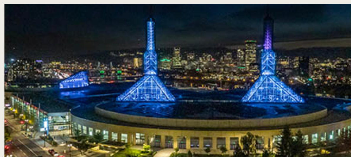
Oregon Convention Center (OCC)

LEED® Platinum certified convention center.