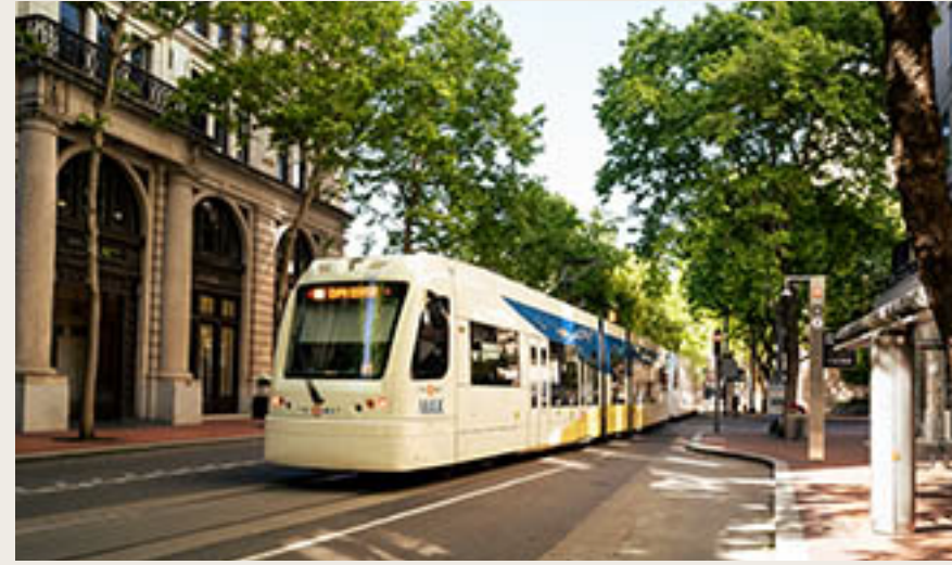
Getting Around Town