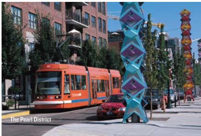
The Pearl District